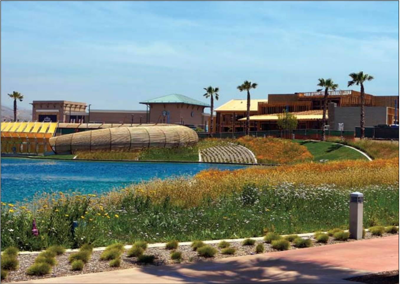
Kammeyer & Associates has worked on projects as diverse as Dos Lagos, above, and the “Energy Fountain” at the Interpretive Garden in Costa Mesa.

I t would take a coffee-table book to fully profile the expertise and history of Kammeyer & Associates (K&A), the Corona-based firm specializing in landscape architecture, land planning and environmental design.